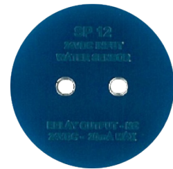
SP-12 (24VDC) Blue colored PCB